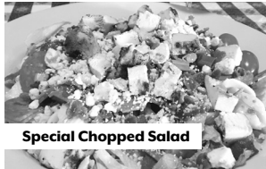
Special Chopped Salad