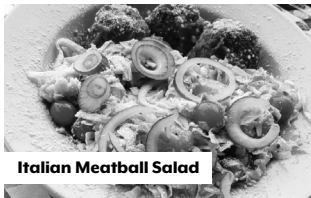
Italian Meatball Salad

This Chicago style salad is a combination of chopped lettuce, red onions, provol cheese and tossed in Italian dressing, then topped with 3 homemade meatballs smothered in marinara sauce and parmesan cheese