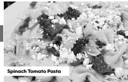
Spinach Tomato Pasta

All pastas made to order Served with a side salad and dressing of your choice