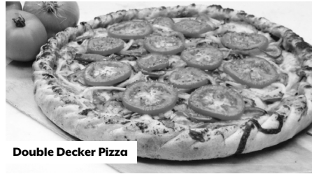
Double Decker Pizza