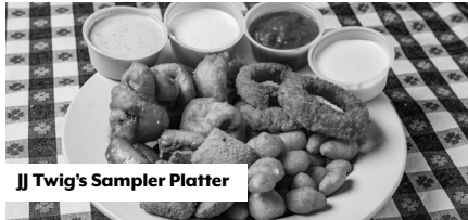
JJ Twig's Sampler Platter

Add mozzarella, provol, american, cheddar, swiss, pepperjack or bleu cheese crumbles .99