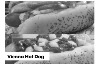
Vienna Hot Dog

Make it 2 for only 8.49 "The Works" - mustard, relish, onion, tomato, pickle & sport peppers, topped with celery salt